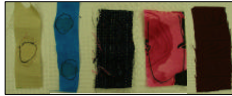
Figure 1: Various fabrics that were used in extraction procedure, from left to right, fabrics 1 thru 5.

As a final step in evaluating which DNA extraction method worked best for our lab, a cost per sample analysis was performed based on list price (table 4). ForensicGem was lowest in price, while Qiagen MicroPrep and Organic extractions were highest in price.